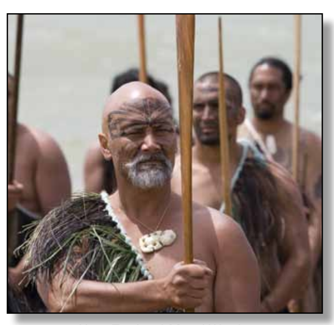
New Zealand Maori Warrior

New Zealand is mostly made of two large islands: North Island and South Island. Together, they are about the size of Colorado. The capital of New Zealand is Wellington. Wellington is on North Island. So is Auckland, the country's largest city. But most of New Zealand is not made up of very large cities. Instead, there are many smaller cities and towns.